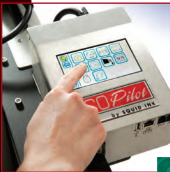
CoPilot's 4.3" full color touchscreen provides access to the systems internal messages and print functions.