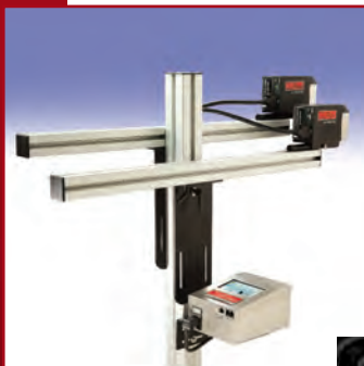
Run up to two printheads from a single controller.