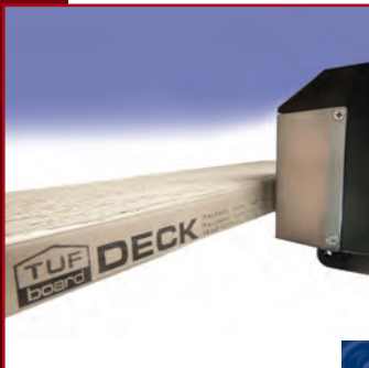
CoPilot utilizes oil-based or solvent-based inks for printing on a wide range of porous and non porous surfaces. The optional Quick-Dri head reduces drop size for faster dry times.