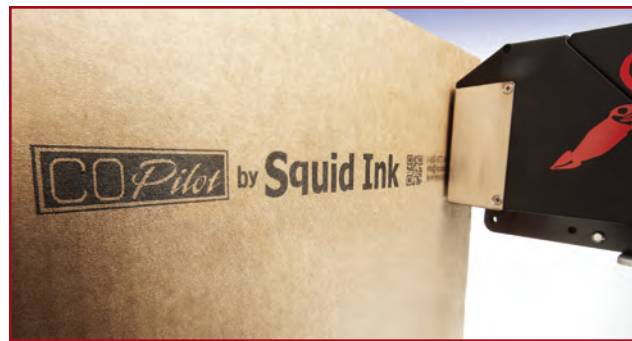
CoPilot offers premium print quality for razor-sharp logos, small character text and scannable bar codes.